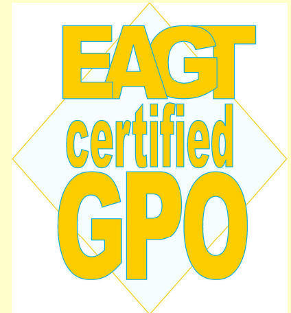
'logo for certified GPO's'